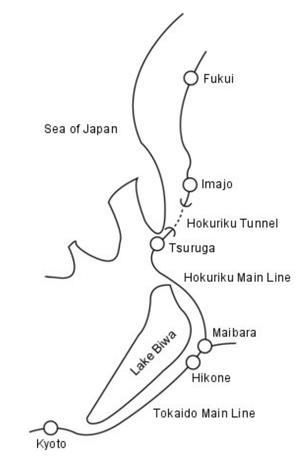
Figure 1. Hokuriku Tunnel

train c onductor. The train conductor immediately arranged an emergency stop, and at 1:13 am, the train stopped at 5.3km from the Tsuruga Exit (Figure 1).