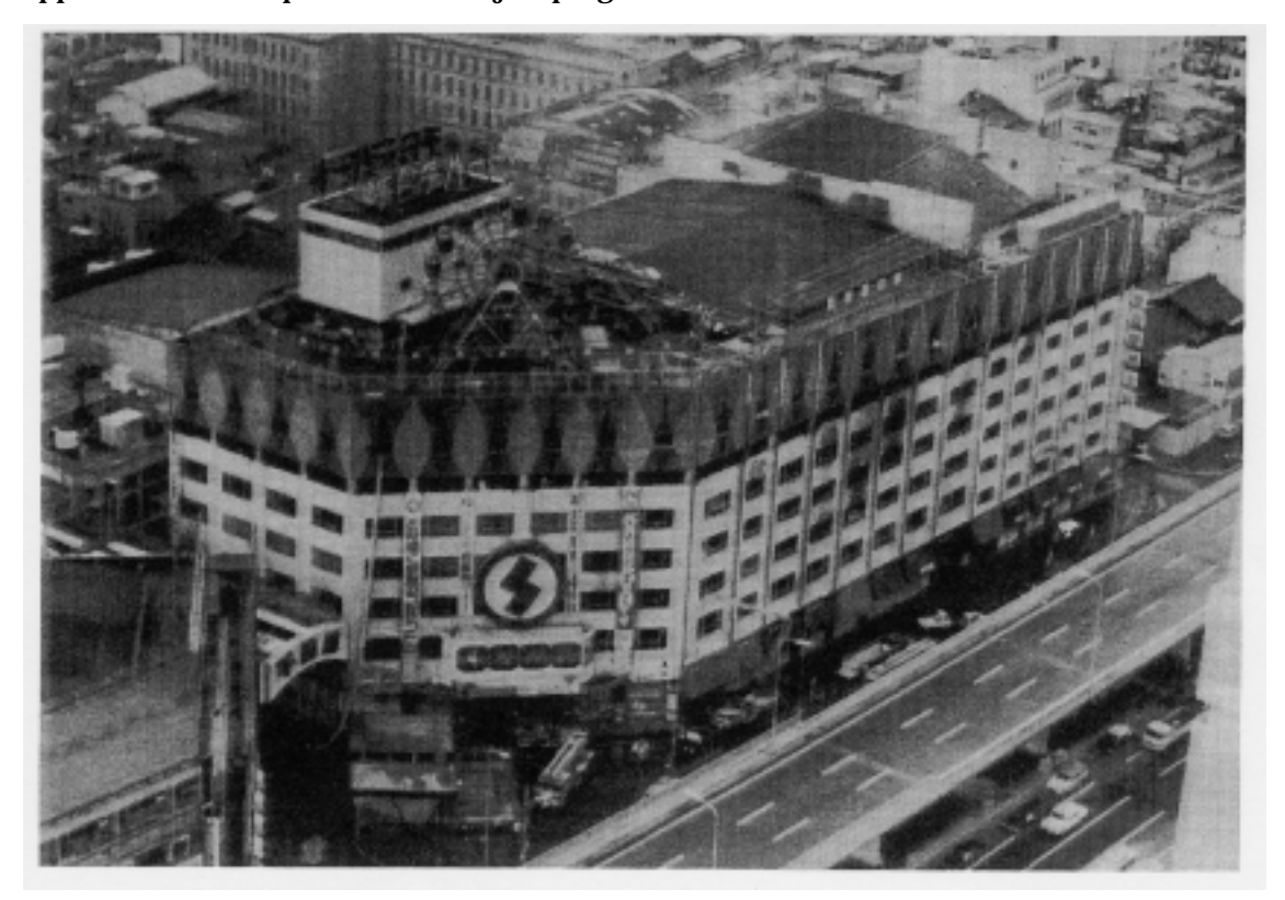
Picture 1 Sennichi Depart (one night passed)

The cause of the fire expansion was thought to be the presence of mass combustibles (ex, clothes). The dead were the people who were in the Play town on the 7th floor. The reasons of death were 93 persons due to carbon monoxide intoxication, 3 persons due to oppression, and 22 persons due to jumping off.