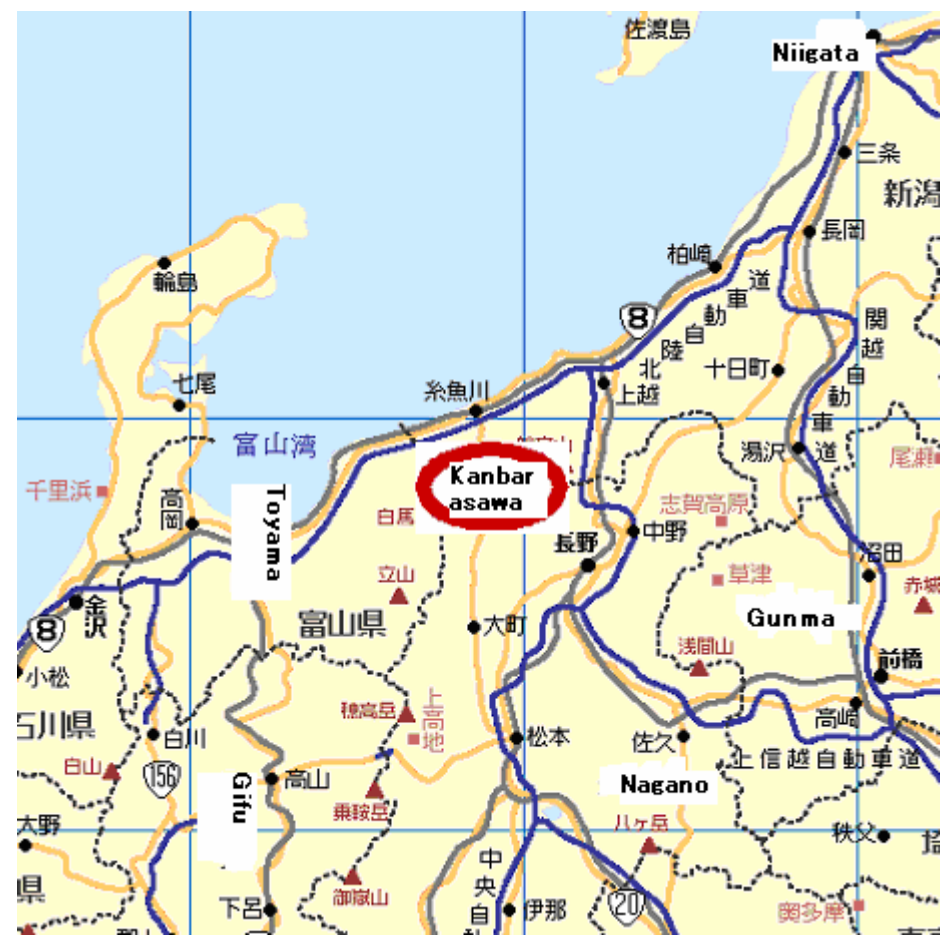
Figure1 The position of Kanbarasawa

The large-scale debris flow arose in Kanbarasawa, Otani village, Nagano Prefect ure at ar ound 10:40 a.m. on December 6th, 1996. The destruction at an altitude of around 1300m became a trigger for this debris flow, and it flowed over five waves (or eight waves (when small waves are included). one of two valley closing constructions which did not have deposited silt right after the concrete cast was completely destroyed and the other was half destroyed by the first wave which was the biggest. After the debris flow passed the 2 check dams downstream with no deposited silt, the check dam under construction and the watercourse construction, it reached t he Himekawa River. This debris flow hit the construction sites of disaster related project etc, which Ministry of C onstruction (now Ministry of Land, Infrastructure and Transport), Forestry Agency and Nagano Prefecture ordered. In this d isaster, the ere w ere fourt een fa talities, a nd nine people were in jured. The position of Kanbarasawa in Honshu is shown in Figure 1.