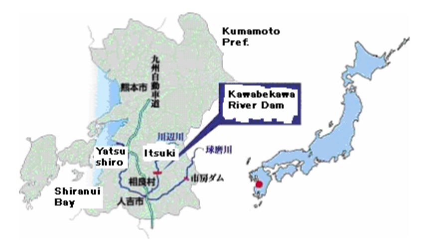
Figure 1- The projected position of Kawabekawa River dam construction

The Kawabekawa River dam construction plan is the public work which plans the multipurpose dam construction for the purpose of river improvement, water utilization, discharge-control, and power generation. (figure.1)