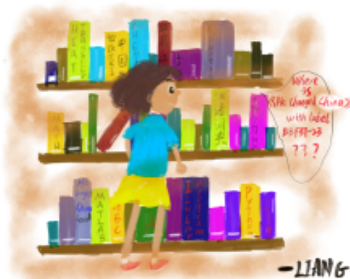
Fig. 1 Hard to find a certain book quickly in a bookshelf

Nowadays, although the existing book management systems are powerful to give people general location information of the books they cared about, there is still a last-step problem of finding a certain book. When people arrive at the desired bookshelf based on the searching result, it is still confused to recognize the desired book using the index information. It is not only because the books will be placed disorderly during the borrowing and returning process, but also due to the difficulty of recognizing the book index.