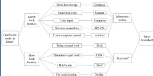
Fig. 2 Design Record Graph

To solve this problem, what we need is to search the book location information and show the location automatically.