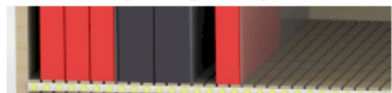
Fig. 4 Slots, Claspboards and LED